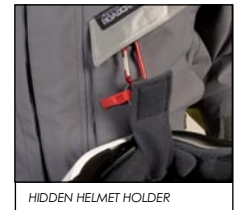
HIDDEN HELMET HOLDER