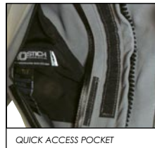
QUICK ACCESS POCKET