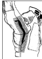
1. UNDERARM ZIP STITCHING

The stitching adjacent to the underarm zips (1) and leg zips (2) can only be hand sealed using Aqua Seal®, Seam Grip®, or other commercially