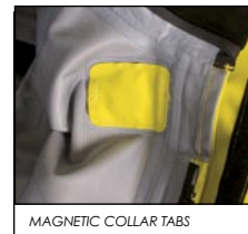
MAGNETIC COLLAR TABS