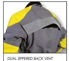
DUAL ZIPPERED BACK VENT