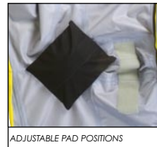
ADJUSTABLE PAD POSITIONS