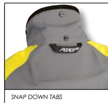
SNAP DOWN TABS

The elbow and knee pads may be located up or down by as much as 2" to position the pads for optimum protection, comfort and fit.