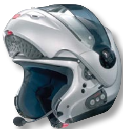
BASIC KIT & INTERCOM E-BOX INSTALLED ON AN N-102 HELMET

To take full advantage of the Basic Kits, you'll need an "e-box". The e-box is a small, thin, black box that installs on the side of the helmet when you remove the small door that is located on the left side of all N-Com ready helmets. Each e-box comes with a charger and a battery.