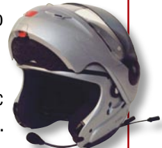
BASIC KIT INSTALLED ON AN N-102 HELMET

Each helmet must be equipped with a Basic Kit. It includes earphones, a microphone and two short wires (hanging from the underside of the helmet) that allow you to plug in various devices and the charger (for an e-box). The Basic Kit will permit you to listen to an music player or a GPS unit, etc., and talk on your cell phone. Basic Kits are specific for each helmet, so there is a Basic Kit for the N-102 (#1266), N-103 (#1291, not pictured) and a different one for the N-42 (#1267). The Kit can be installed in minutes inside the helmets, without any tools or modifications.