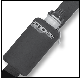
Water Bottle Holster (3" x 5.25") #1913 $26.00 (includes bottle)

Shoulder Strap Enhancements - These six holders all attach to the shoulder strap with a secure overlapping hook & loop. Great storage for often used items.