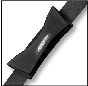
Eyeglass Case (3" x 7.5") #9136 $32.00