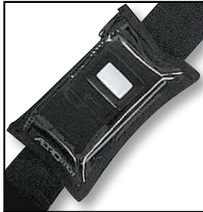
Small Zippered Pocket (3.5" x 5.5") #1904 $18.00