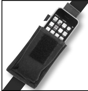
iPhone & Blackberry Holder (3.25" x 4.75") #9208 $22.00