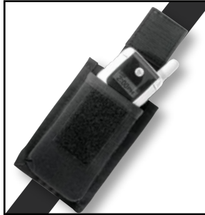
Cell Phone Holder (2.75" x 4.75") #9183 $22.00