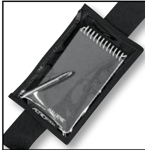
Med. Zippered Pocket (4.75" x 7.5") #1906 $19.00